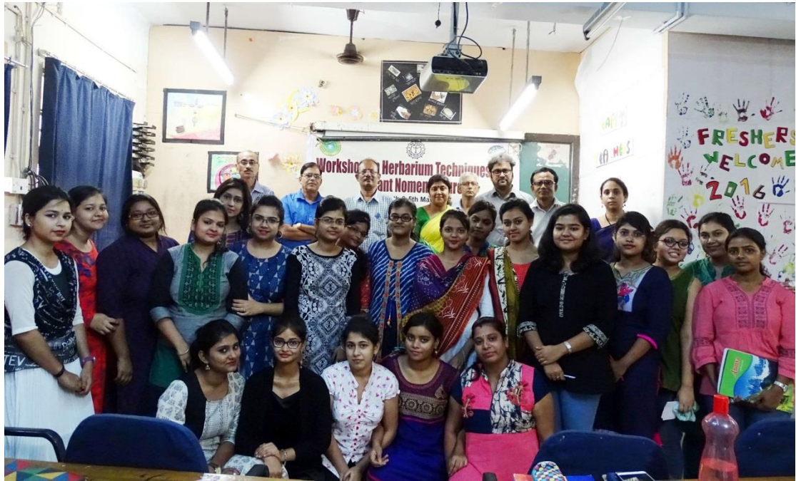
Group photograph during the workshop