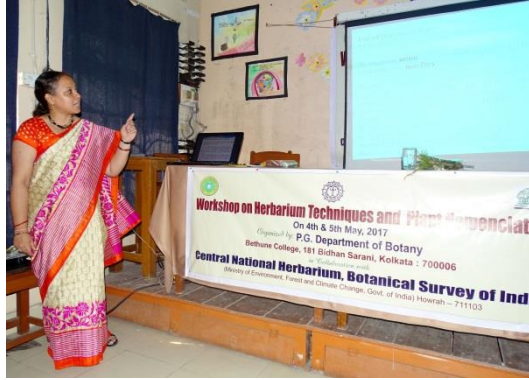
Resource persons giving practical demonstration and delivering lectures