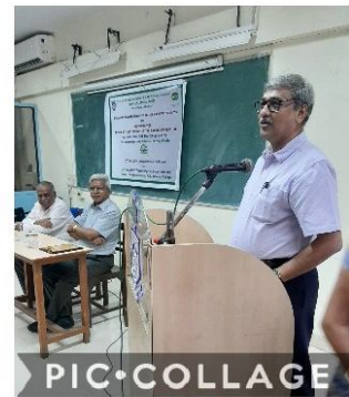
Inaugural function, Group photo, Glimpses of Technical sessions, practical session and test paper correction during workshop