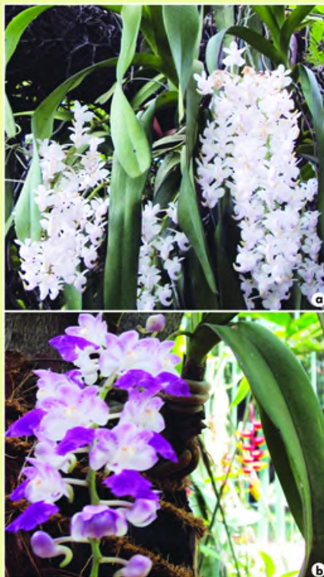
a. Aerides odoratum ; b. Aerides multiflorum

AJC Bose Indian Botanic Garden, Botanical Survey of India, Howrah – 711 103.