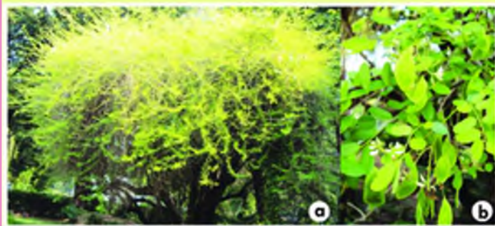
Dalbergia melanoxylo : a. Habit; b. Twig with flowers and pods

AJC Bose Indian Botanic Garden, Botanical Survey of India, Howrah – 711 103.