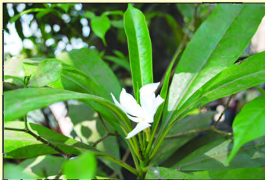
Cerbera odollam : Flowering twig

Cerbera odollam is an evergreen tree with acrid milky latex, and grows 20–25 m tall. Leaves are alternate, whorled or closely set at the end of the branchlets, oblanceolate or oblong-obovate in outline, 10–25 cm long, glossy and deep green. The fragrant, white flowers with yellow throat are produced in terminal or subterminal panicle cymes. Fruits are subglobose, 10–12 cm in diam., green, pink-tinged when ripen and 1-seeded. The tree flowers during January–March, and fruits from April to August. In India, this species is distributed in Andaman and Nicobar Islands, Karnataka, Kerala, Tamil Nadu and West Bengal, also found in Malay Peninsula, Malesi and Sri Lanka (Huber, 1983).