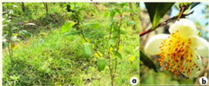
Camellia sinensis : a. Plantation; b. Flower