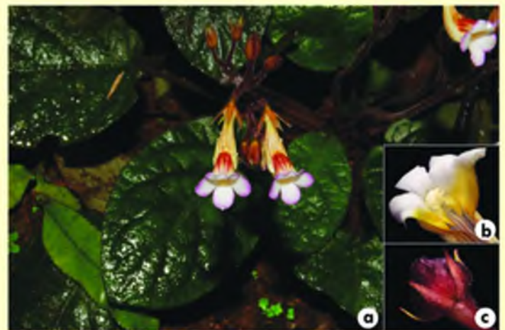
Jerdonia indica : a. Habit; b. Corolla split-open; c. Fruit.