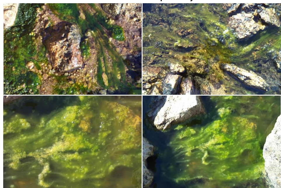
Cyanoprokaryotes and Algal Diversity