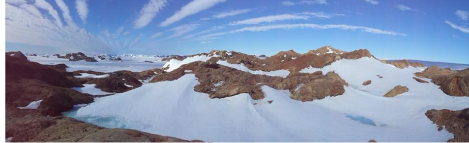
Frozen Lake with exquisite sky