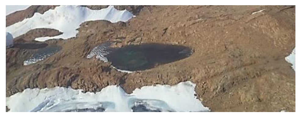
Aerial view of Lake

Variety of fresh water and saline lakes in Antarctica contain limited range of aquatic life. Due to very harsh extreme cold environmental conditions, the Antarctic flora is sparse and only Bacteria, Cyanoprokaryotes (Cyanobacteria), Algae, Bryophytes, Fungi and lichens can survive. Antarctica has no trees or bushes. Only flowering or higher plants Deschampsia antarctica É. Desv., a grass belonging to the family Poaceae and Colobanthus quitensis (Kunth) Bartl. of the family Caryophyllaceae reported from Antarctica. Antarctica is also home to Seals and Penguins.