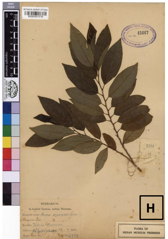
Photo Plate 2 : E - Thalictum foliolosum Dc. ; F - Aconitum lacinitum (Bruhl) Stapf; G - Illicium manipurenses Watt; H- Annona squamosa L.